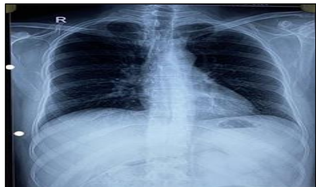
Figure 2: Chest X-ray preview- no abnormality.

He had arthralgia during fever but had no active arthritis. He often had pain in his neck and shoulders during fever. The cough was non-productive and often followed the act of swallowing. Even before the onset of fever, he occasionally had cough on exposure to dust or cold weather. Throat pain was severe and persistent all the time and most annoying of all the complaints. There were no swellings in the neck. He had mild burning micturition during fever. Appetite was normal and there were no gastrointestinal symptoms. He had streaky haemoptysis once, during a bout of violent cough.